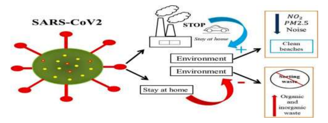
Figure 1 Recycle Button Hitted on Nature Due to Pademic